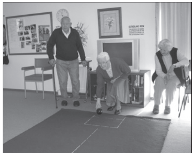
Residents show their style during a game of 'indoor bowls'