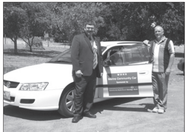
Community Transport volunteers display the new vehicle logos displayed on both the Coleraine and Merino Community Cars and kindly sponsored by the Coleraine Bendigo Community Bank