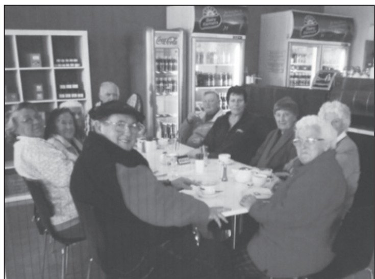
Merino participants enjoying a get-together with each other during one of their many outings