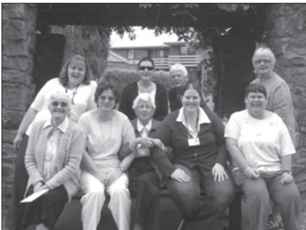
'Girls just wanna have fun' PAG participants and staff share good times