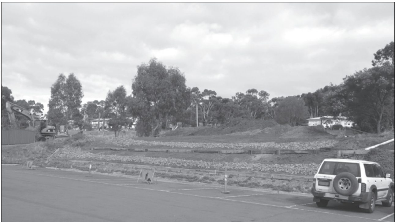
Earthworks were carried out to construct a retaining wall on the southern side of the Hospital car park