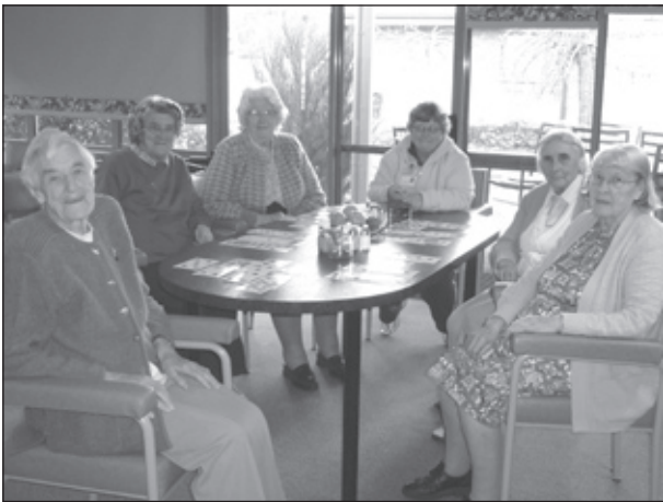
Ladies enjoying a get-together and a friendly game of cards