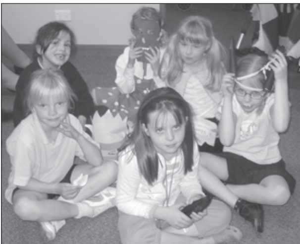
Local school children get ready to entertain the residents with a play