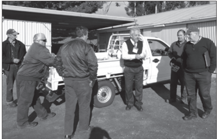
The Maintenance Crew receive instruction on suitable protective attire for use while working