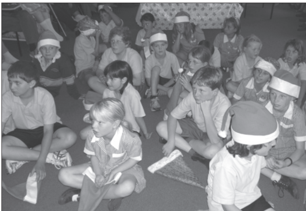
Local St Joseph's School pupils visit and entertain the residents for their Christmas Party